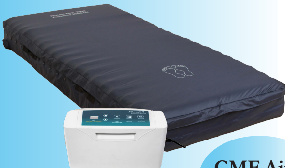
GMF Aire 4000DX